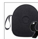
HEADSET CASE & HANGING HOOK