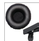
50mm CUSHION & CLOTHING CLIP