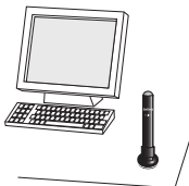
Position the Busylight with double adhesive tape